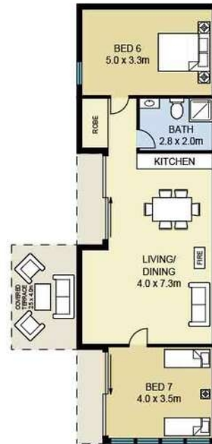
CASITA 1 = C1